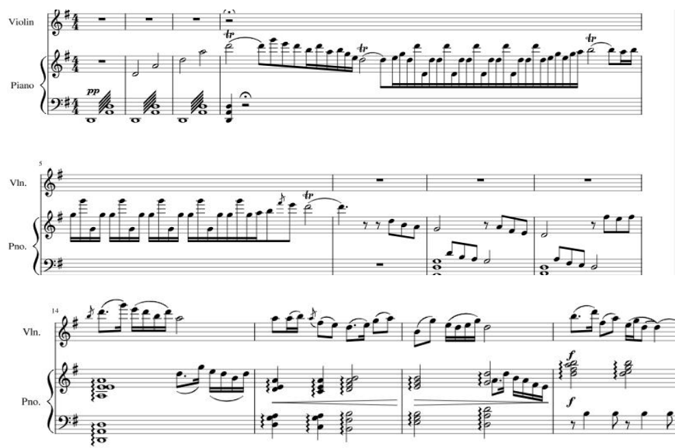
Figure 1. Butterfly Lovers Violin Concert

"Guangdong Folk Songs" by Various Composers as shown in Table 2 and Figure 2.