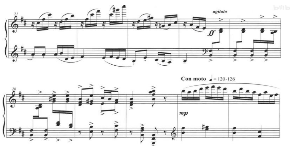
Figure 2. Guangdong Folk Song Tunes

These case studies demonstrate how specific piano compositions embody the characteristics of Guangdong piano music, showcasing a harmonious fusion of Western and Chinese musical elements while maintaining a strong connection to the region's cultural heritage.